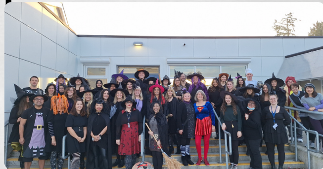
Our spooky team on Halloween